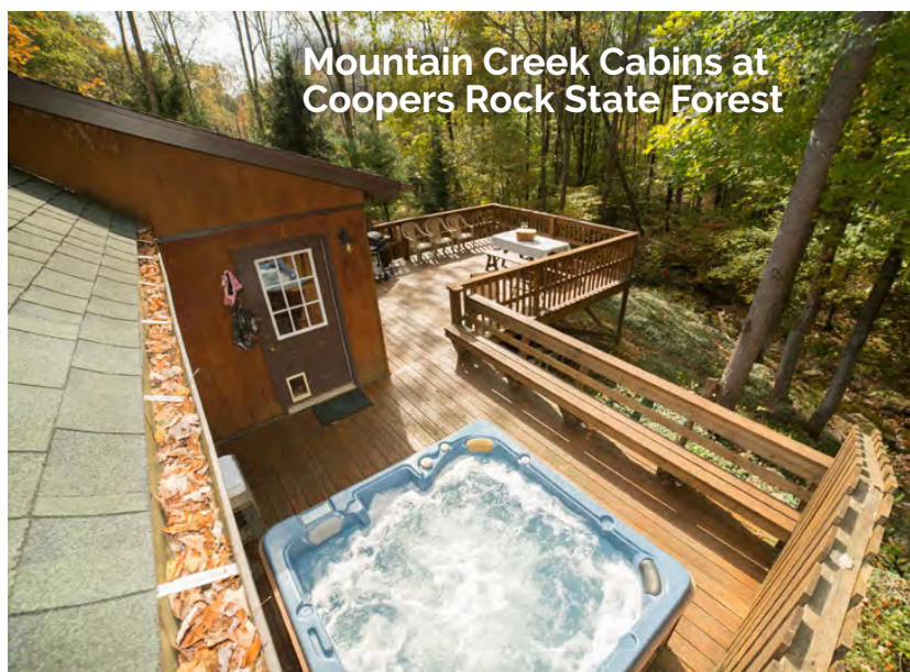
Mountain Creek Cabins at Coopers Rock State Forest