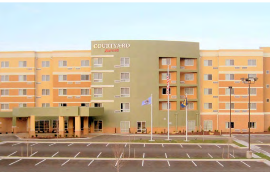
Courtyard by Marriott Morgantown