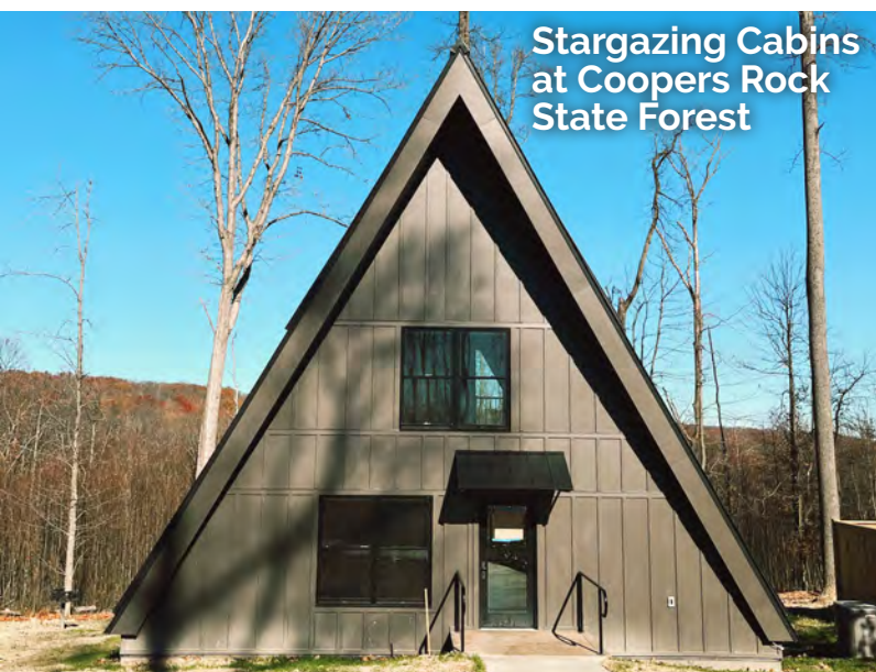
Stargazing Cabins at Coopers Rock State Forest